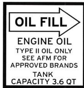
Figure 2-54 (cont'd). Fuselage, Aft Left

- CAUTION - DO NOT MIX BRANDS CHECK ENGINE LOG