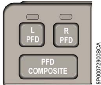
Figure 7-27. Keyboard, Composite Group Keys