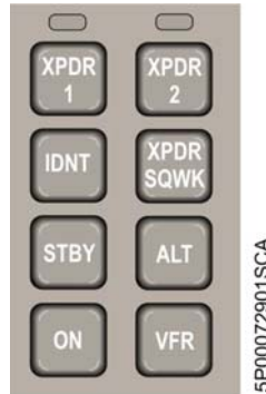
Figure 7-29. Keyboard, Transponder Group Keys

The Composite group keys allow switching the L or R PFD into or out of Composite Mode.