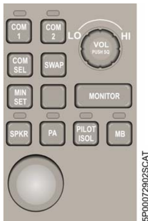
Figure 7-28. Keyboard, COM/NAV Group Keys

The Composite group keys allow switching the L or R PFD into or out of Composite Mode.